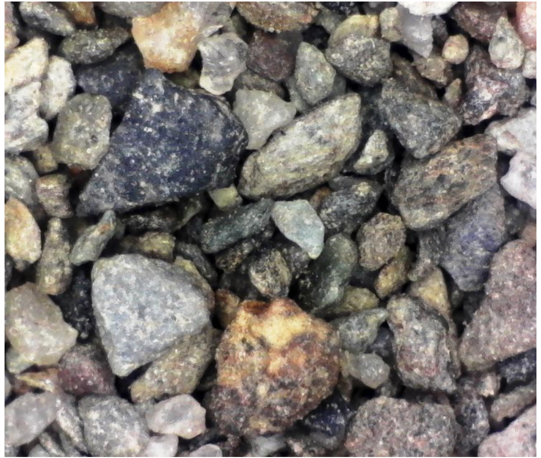
Coarse-grained, poorly sorted stream sand composed primarily of subangular rock fragments (FOV ~ 5mm across)