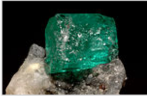
Emerald on matrix

Beryl - (Emerald, Aquamarine, Heliodor, Morganite) \text{Be}_3\text{Al}_2(\text{SiO}_3)_6